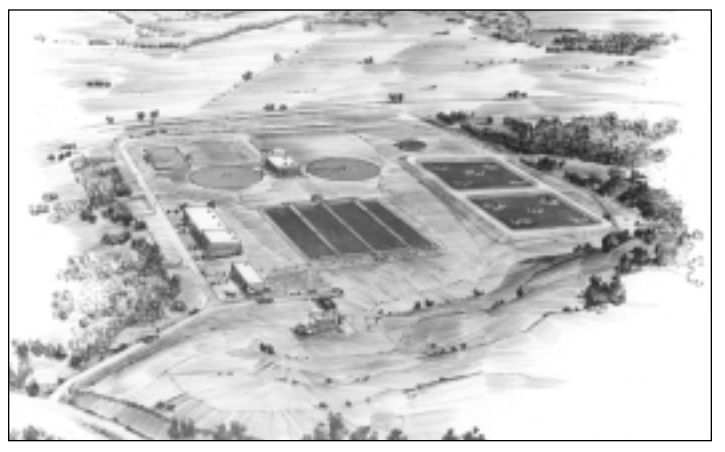
H.C. Morgan Wastewater Treatment Plant

One of the City's goals for this year is to arrange financing for the construction of the expansion of the Northside Wastewater Treatment Plant and for the installation of a major sewer line on the southwest part of Auburn. As part of the plan to arrange how to pay for these improvements, the City Council asked that it be done without raising sewer rates. On May 15, the Council approved a plan to raise the $10 mil-