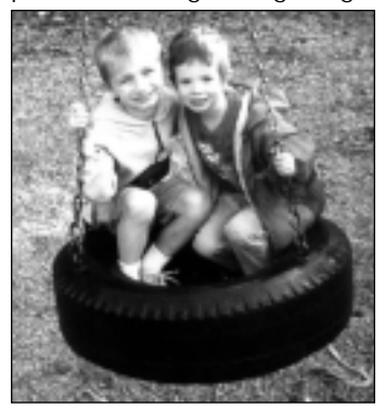
Two of Auburn's youth enjoying Summer Day Camp.

Swimming classes are offered throughout the summer at Samford Pool for beginners and advanced swimmers. Other aquatic activities such as scuba, water polo, snorkeling, diving, lifeguard training, and water