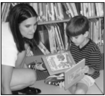
A young boy picks out a book from the Library.

With a new facility, a larger staff, and exciting new programs, the Auburn Public Library offers more reasons than ever to visit. For information on these programs and when they will be offered. call 887-4997. If you haven't