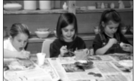
Local children participating in arts and crafts.

Summer is a great time to explore individual creativity by participating in arts and crafts classes. Afternoon Art for Young Children is a series of art activities