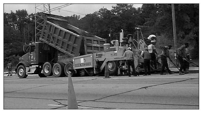
Summer street resurfacing has begun.

Please use caution as you travel in the areas that are under construction. We appreciate your patience as we strive to maintain Auburn's roadways in a good condition and improve our transportation network.