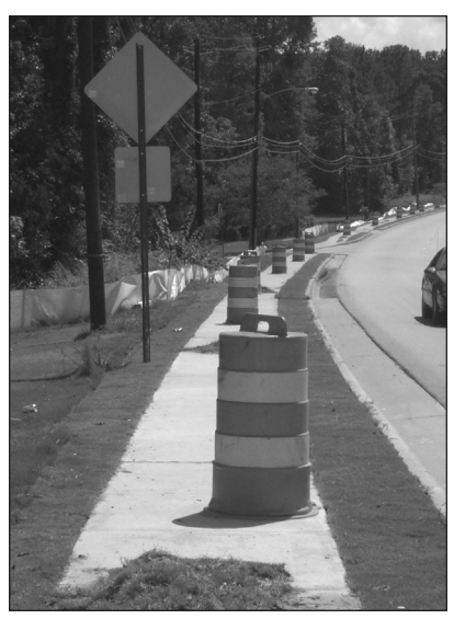
The sidewalk on South College Street is under construction.

Alabama Power has recently completed installation of most of the street lights on the East Glenn Avenue reroute. These lights were installed with underground wiring and will provide a safer environment for travel-