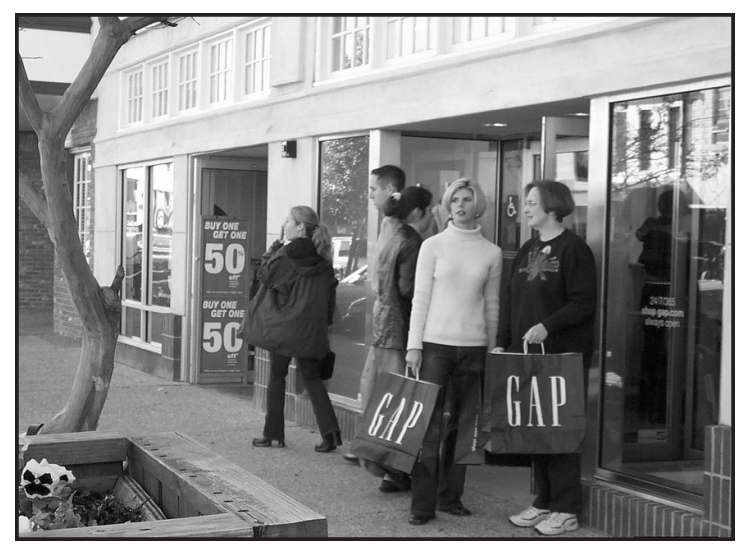
Keep your tax dollars in Auburn by shopping locally.

Sales taxes received by the State of Alabama in December were down about one-fourth of one percent from the prior year. Municipal sales tax revenue statewide has experienced a slight downturn, negatively impacting the budgets of many Alabama cities. For example, Montgomery has reported a decrease in sales tax of approximately 2% for the fiscal year ended September 30, 2001 and Gadsden has reported a decrease