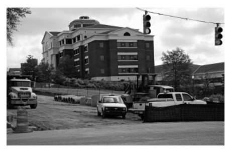
Infrastructure Improvements (Donahue Drive - Magnolia Avenue intersection improvements)