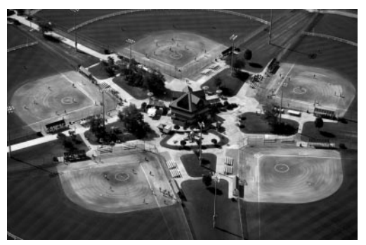
City Facilities (Auburn Softball Complex)

Several current and upcoming projects should help address these concerns. In January, Auburn voters approved the use of proceeds from the Special Five Mill Tax Fund to provide $9 million in infrastructure and public improvements. One project approved by this