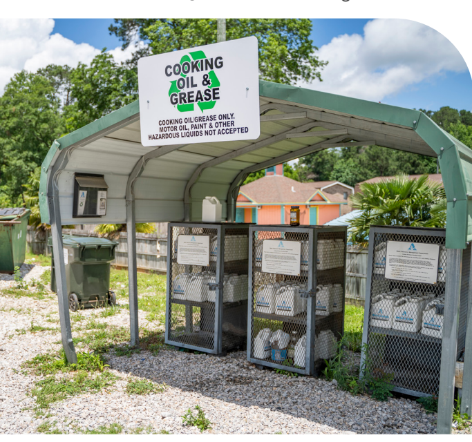
The Cooking Oil and Grease recycling receptacle is located at the Recycling Drop-Off Center, 365-A N. Donahue Drive

For more information, visit auburnalabama.org/waterresource-management/fog-recycling or contact the Water Resource Management Department at (334) 501-3060 or webwtrswr@auburnalabama.org.